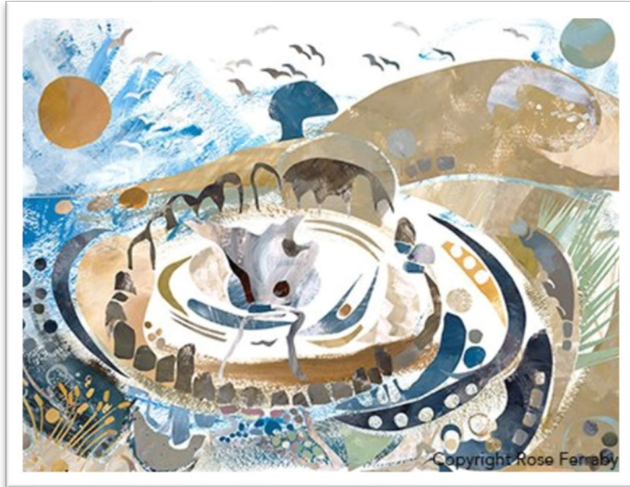
Painting by artist Rose Ferraby who was also commissioned by the British Museum to create a film and sound installation about Seahenge in association with the World of Stonehenge exhibition at the British Museum