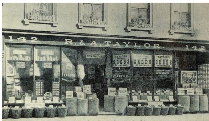
Taylor's Seed shop, King's Lynn, 1907. A display about the seed shop forms part of the current exhibition

The current exhibition opened on 16 October 2021 and will run until 12 June 2022. The displays tell the story of gardens and gardening in the King's Lynn area, including the display of collections from the Taylor's seed merchants business in the town and material relating to the Walks and other public gardens.