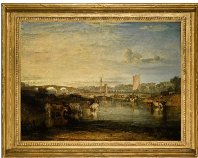
J.M.W. Turner, Walton Bridges (1806)

When the tour arrives at Lynn Museum in June 2022, the exhibition will have a particular focus on the artist's use of water. Turner has always been especially admired as a painter of earth, air, fire and water, the 'four elements'. Many other artists were also deeply inspired by the ways in which he captured these fundamentals of nature.