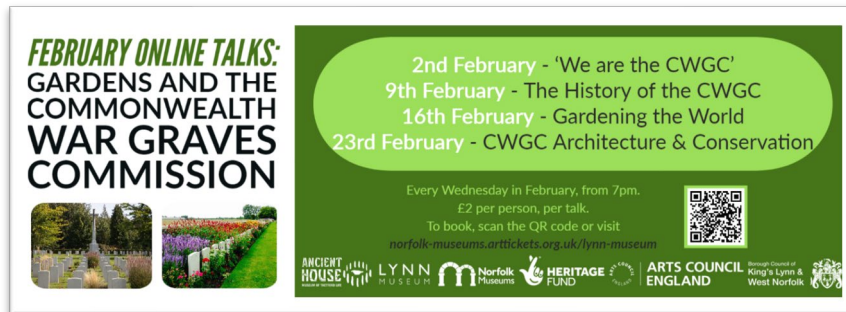
Poster advertising online talks from the Commonwealth War Graves Commission organised by Lynn Museum and Ancient House, Thetford, in February 2022

In February 2022 Lynn Museum provided a season of on-line talks given by members of the Commonwealth War Graves Commission.