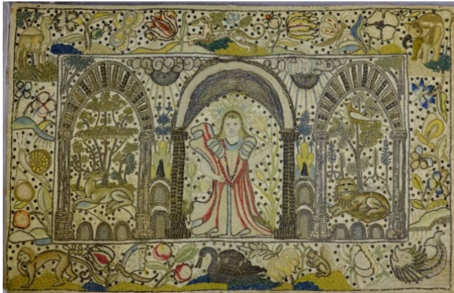
Embroidery c.1650 with goddess surrounded by garden scenery. Featured in the current Gardens exhibition at Lynn Museum