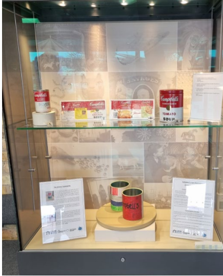
Campbells' Cans Reimagined - Display created by young people from the Kick the Dust scheme at Lynn Museum. It commemorates King's Lynn's Campbells heritage. The firm had a factory in the town for many years.

7.3 Lynn Museum has again seen much interest from local schools in visiting. A number of the sessions have linked up with Stories of Lynn at the Town Hall.