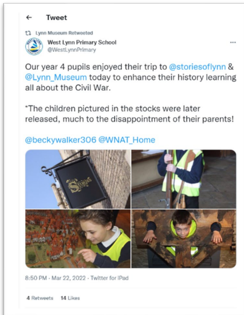
Tweet from West Lynn Primary school showing their appreciation of a joint schools event arranged by Lynn Museum and Stories of Lynn in March 2022 about Civil War history

7.3 Lynn Museum has again seen much interest from local schools in visiting. A number of the sessions have linked up with Stories of Lynn at the Town Hall.