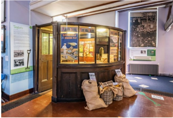
Seed shop display at Lynn Museum